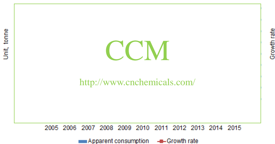
Figure 4.1-1 Apparent consumption of PF and its growth rate in China, 2005-2015